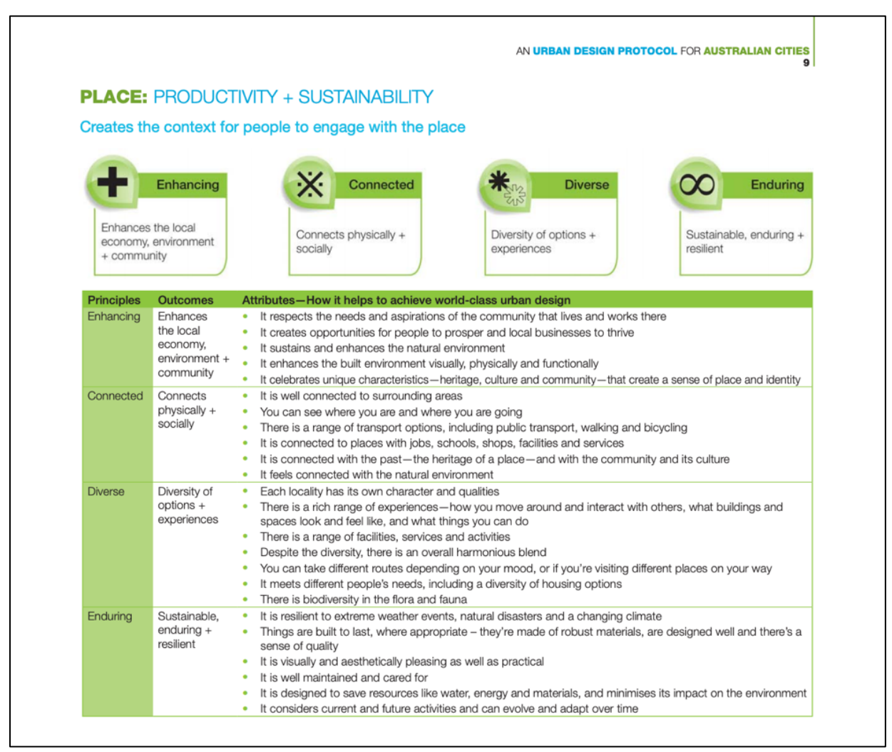
Figure 2: Place Productivity and Sustainability p.9 Aust.Govt. Urban Design Protocol for Australian Cities

An example of recognising the value of well managed and governed parks and landscape heritage in terms of resilience is richly analysed in The Federal Urban Design Protocol: